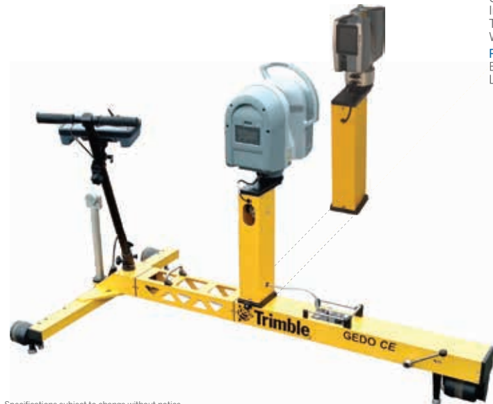
Specifications subject to change without notice